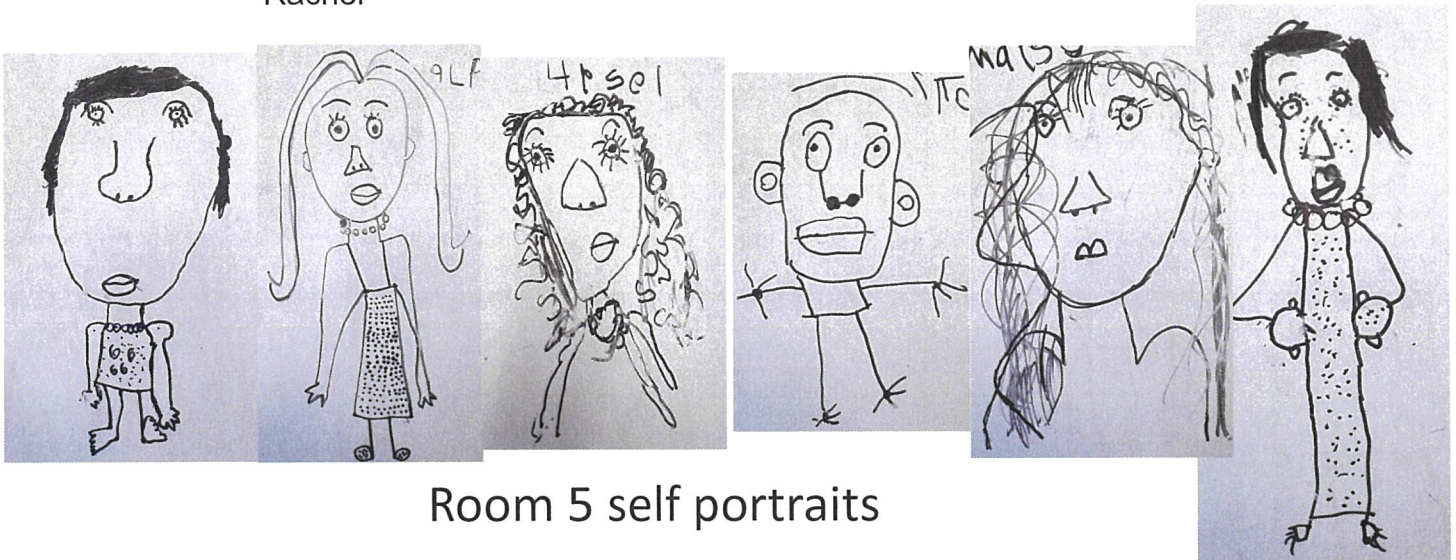
Room 5 self portraits